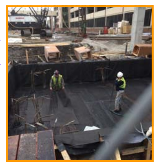
Installation of Waterproofing System with Geo-Seal™ and Bentonite Seal Layers

Potawatomi Casino Parking Structure Addition- Milwaukee, WI